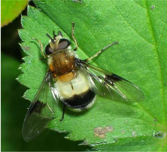
Figure 4. Female of Leucozona lucorum (Linnaeus, 1758).