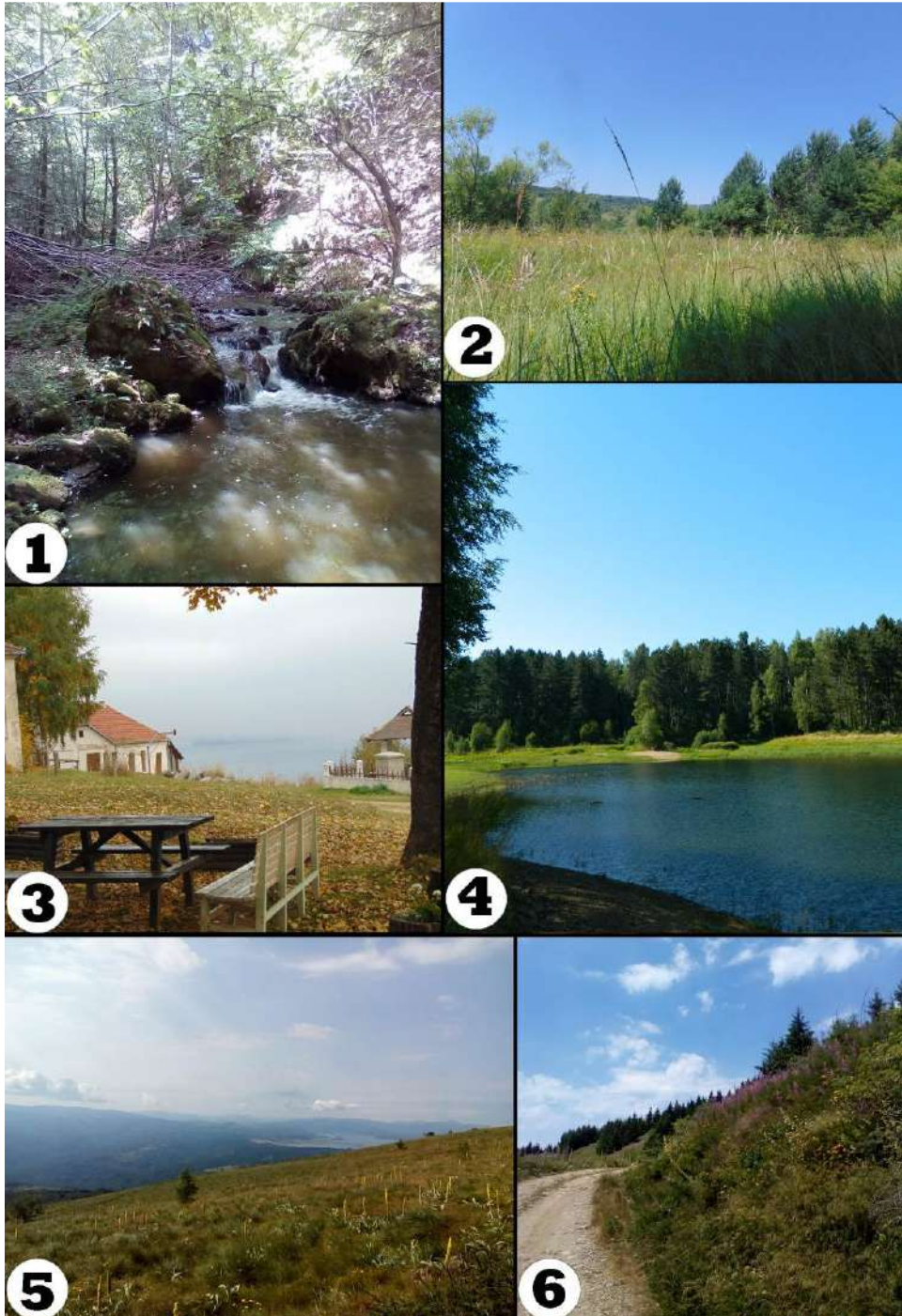
Figure 3. Images of localities: 1. Vučja River (Photo: T. Tot), 2. Delnice (Photo: M. Vujić), 3. Vlasina Rid (Photo: M. Vujić), 4. Vlasina Lake (Photo: A. Erdeš), 5. Vrtop (Photo: T. Tot), 6. Veliki Čemernik (Photo: T. Tot).