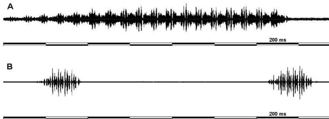
Figure 2: Oscillograms of A) Ch. bornhalmi and B) Ch. brunneus . Temperature of both recordings was 23.8 °C. Scale is 200 ms.

Occasionally, a second – very quiet and very short – echeme can occur. The echeme is characterised by a fast crescendo, with a quiet first part (1/6-1/3 of the song duration) and a louder second part (2/3-5/6 of the song duration). During the second part the echeme remains equally loud (Fig. 2A). The calling song of Ch. brunneus is the same as observed in the northern Serbia (Zasavica) (Skejo, unpublished) and very similar to Ch. brunneus of the Balkans (e.g. from Montenegro, INGRISCH & PAVIĆEVIĆ 2012). The song consists of a larger number of echemes than the song of Ch. bornhalmi (usually more than 5), which are much shorter (every echeme lasts for about 200 ms). The first and the last syllables are more quiet than the intermediate (Fig. 2B).