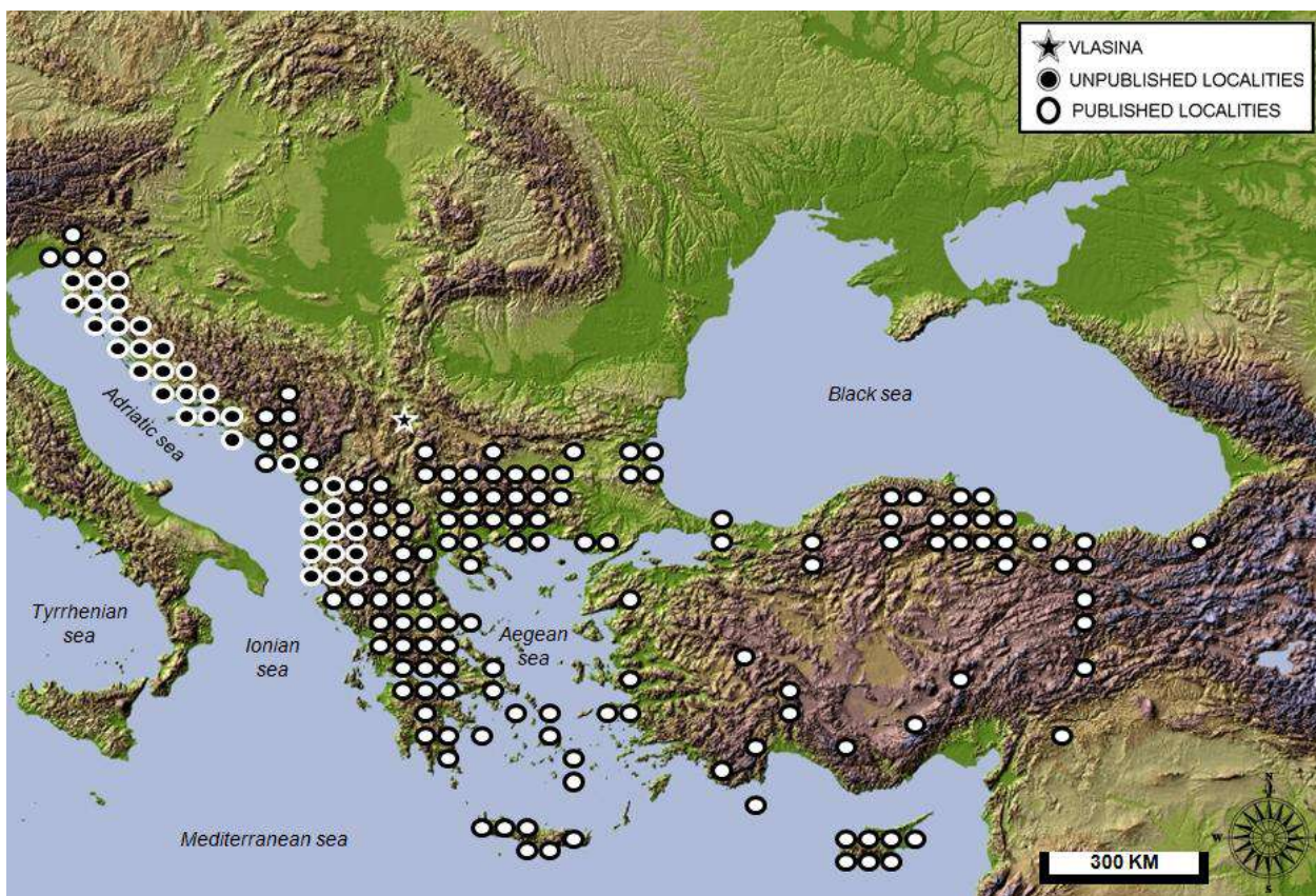
Figure 4: Distribution map of Chorthippus bornhalmi .

Bornhalm's grasshopper is known from Italy (MASSA et al. 2012), Slovenia (GOMBOC & ŠEGULA 2014), Croatia (Harz 1971, 1975, Skejo, Rebrina & Tvrtković unpubl.),