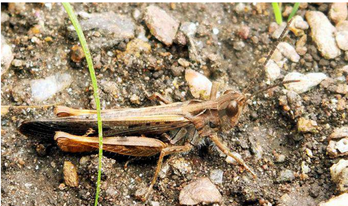
Figure 3: Bornhalm's grasshopper ( Chorthippus bornhalmi ), Vrtop, 16.VII.2014.