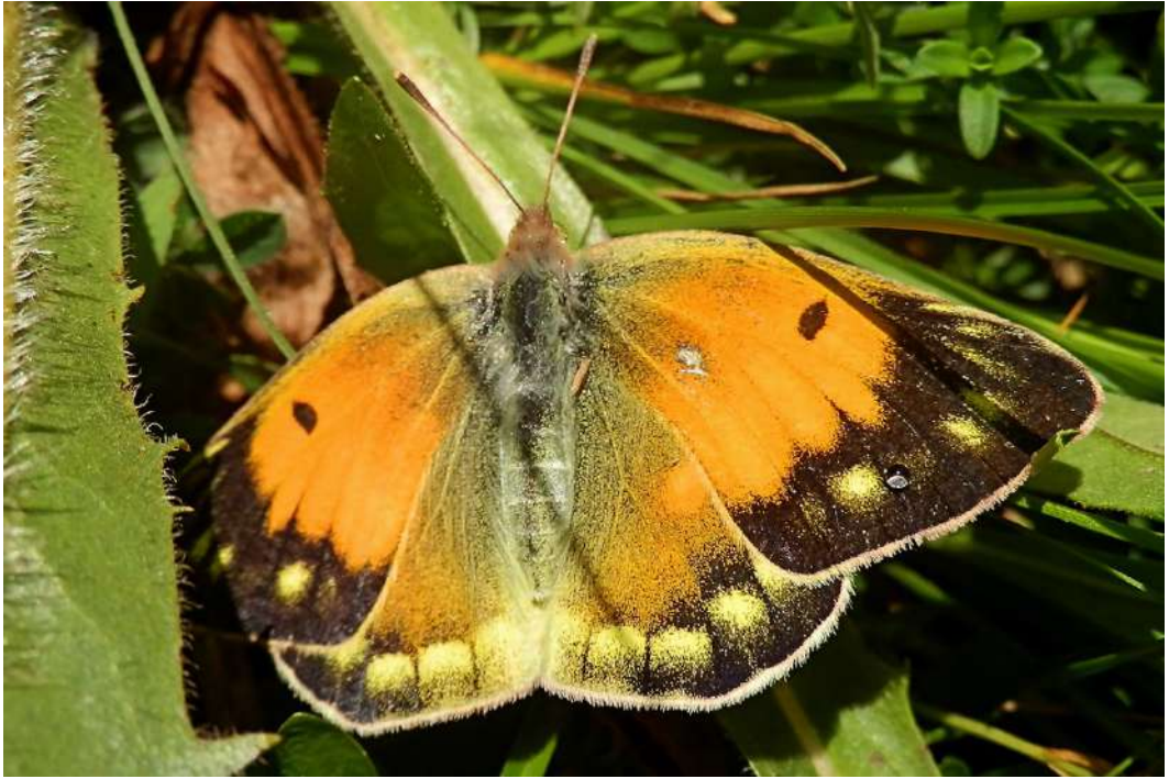
Figure 2. Colias caucasica – female from Mt. Veliki Čemernik 18.7.2014.