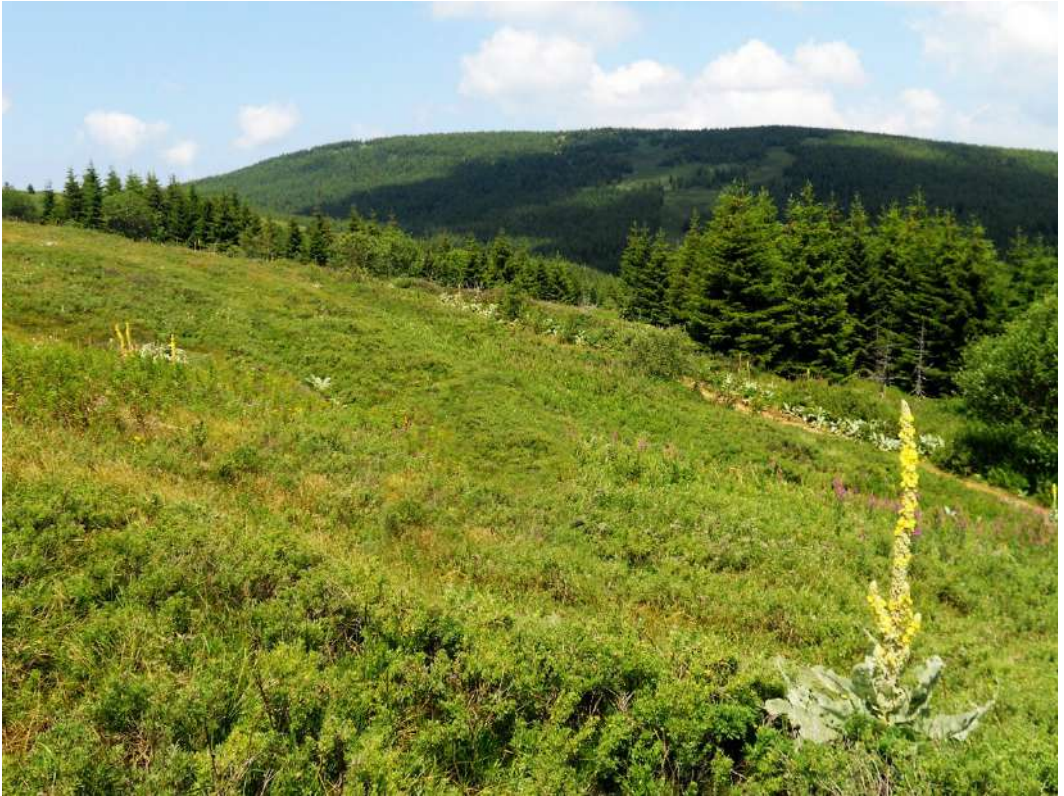
Figure 3. The locality Veliki Čemernik showing the habitat of Colias caucasica .